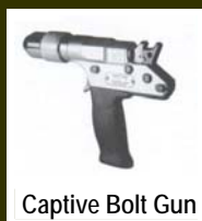
Captive Bolt Gun