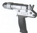
Captive Bolt Gun

'Eat not, Oh believers, of that meat on which Allah (swt's) name has not been pronounced at the time of slaughtering the animal, for surely it is Fisq and certainly the evil do inspire their friends to dispute with you and if you were to obey them by making a dead (un-slaughtered) animal lawful and eating it, then you would indeed be Mushrikoun' (Polytheists). [Surah Al Anam 6:121]